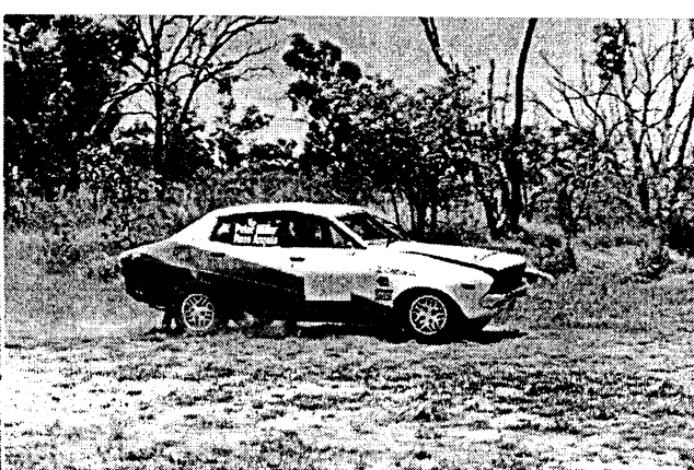
The wrong way