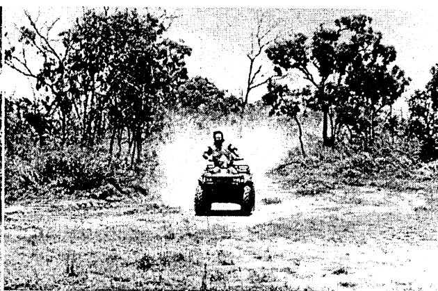
Hey, that works on a Quad too