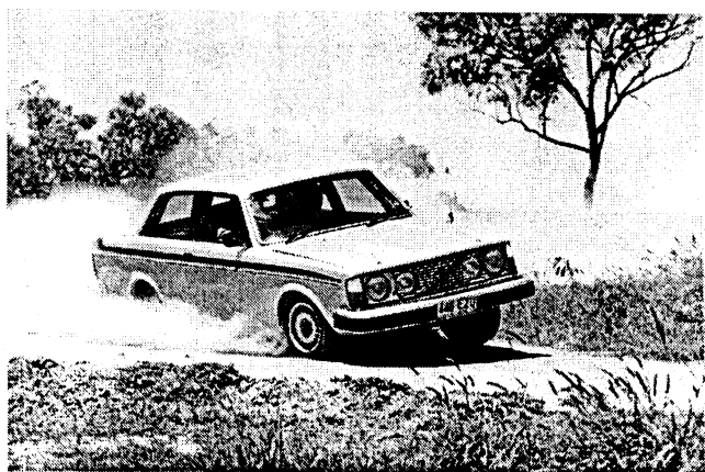
The right way